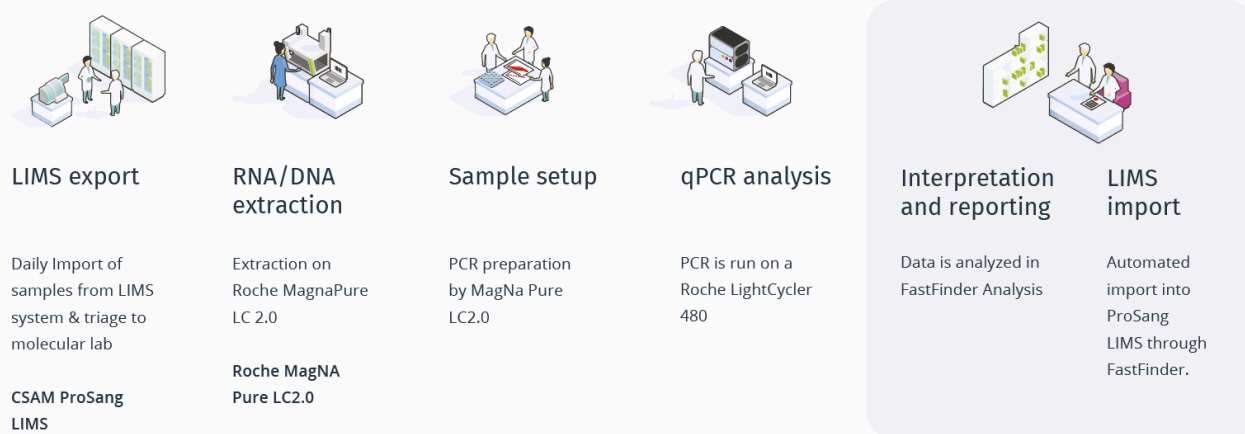
Figure 1 - operations at Odense University Hospital feature automation & standardization across the workflow.

» The laboratory uses a host of technologies to run its operations efficiently.